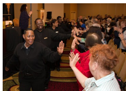
The assembly shares their gratitude to the hotel staff for their warm hospitality and generous care.