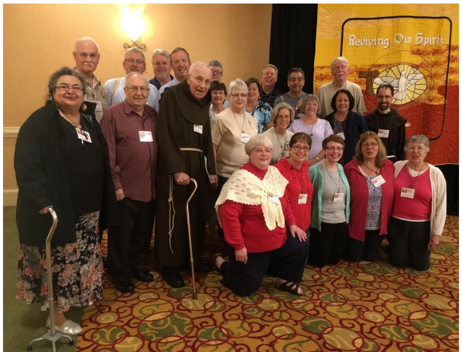
Delegates from Our Lady of Indiana Regional Fraternity sending happy smiles home from in front of the traditional "Q" quilt in St. Louis. Some delegates were not present for the photo . . . off having too much fraternal joy!