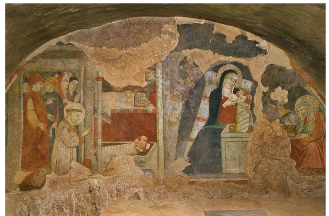
Cave at Sanctuary of Greccio

I wish each and every one of you a blessed and grace-filled Christmas. May it be filled to overflowing with all the gifts with which God wishes to bless you!