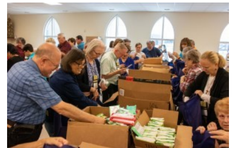
Delegates attending the 2019 Chapter meeting in Corpus Christi fill drawstring backpacks with toiletry items for migrants in Texas