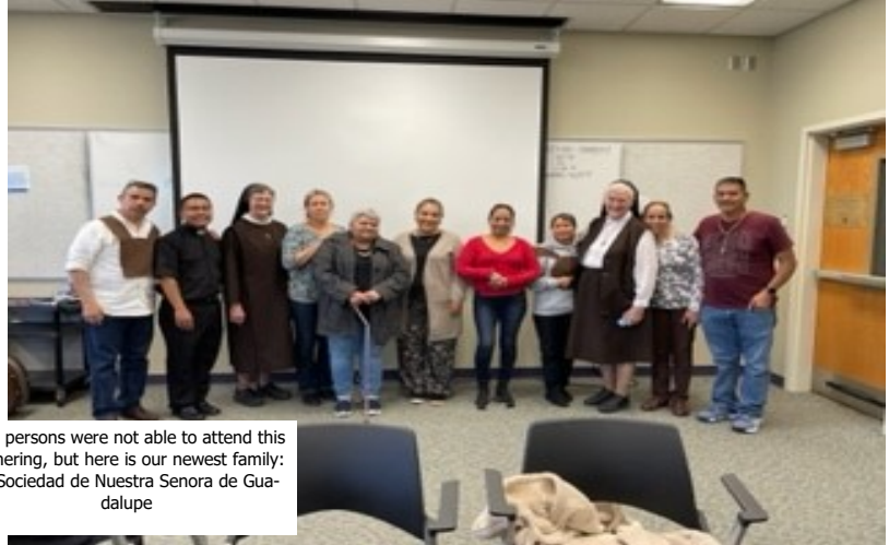
Two persons were not able to attend this Gathering, but here is our newest family: La Sociedad de Nuestra Señora de Guadalupe